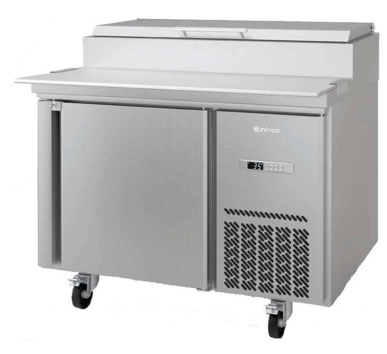
MR 41 EN